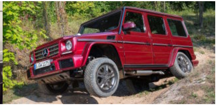
THE TEN BEST OFF-ROADERS THAT AREN'T THE JEEP WRANGLER

As the compact SUV market continues to grow, so do the vehicles. Volkswagen is now entering the market with a car that is practical, innovative, fun and actually still compact.