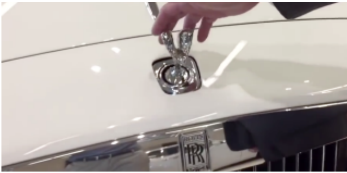
WATCH THE ROLLS-ROYCE SPIRIT OF ECSTASY DISAPPEAR IN AN INSTANT